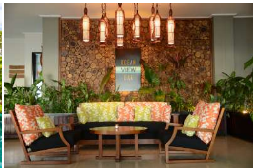
Ocean View Bar