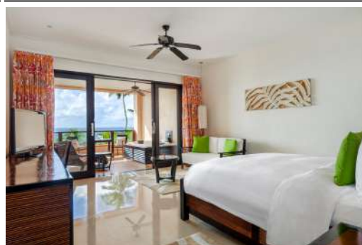
Grand Deluxe Room