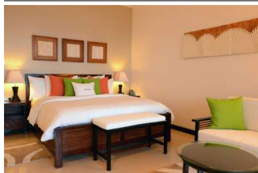
King Guest Ocean View Room