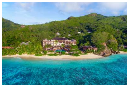
Aerial & Beach View

All rooms are ocean-facing, featuring private balconies that open directly to panoramic views of the Indian Ocean. Each room is designed to offer comfort and convenience, with natural light, soft interiors, and a seamless connection to the outdoors.