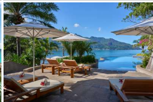
Pool Lounge Area