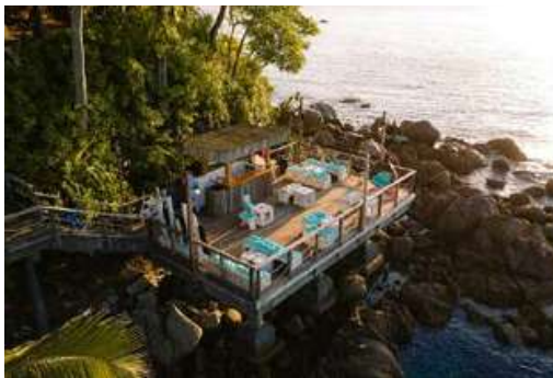
The Lower Deck