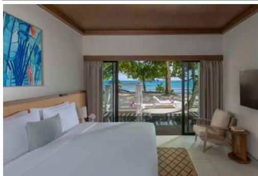
Beach Access Pool Suite