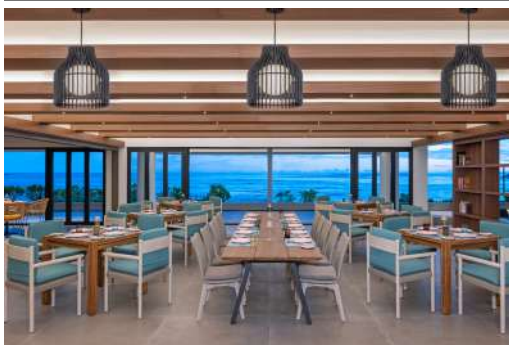
Pti Bazar Restaurant