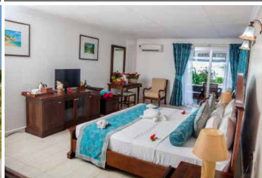
Beach House Bedroom