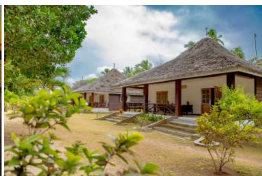
L'Union 2-bedroom Bungalow