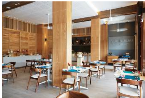
Marlin Bleu Restaurant