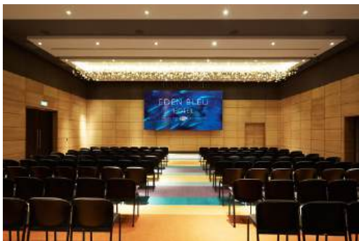
Sub divided Ballroom

Eden Island – Just a stroll away, the scenic Eden Island offers guests access to a vast array of shops and restaurants which are open throughout the day and evening. Various services can be accessed by visitors such as a Casino, Art Gallery, shopping outlets, and the Marina is a sight not to be missed with eye-catching yachts, some of which offer excursions and trips to visitors.