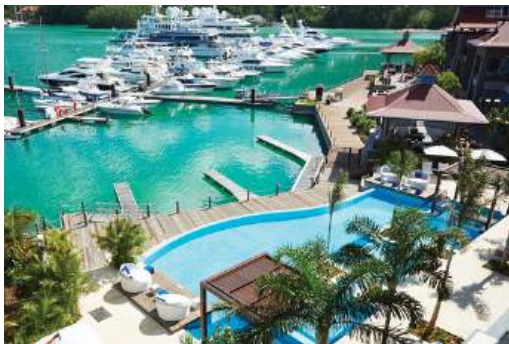
View overlooking marina