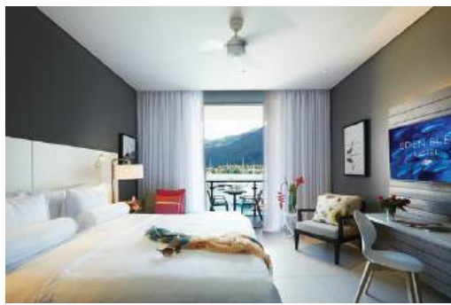
Deluxe Marina View Room