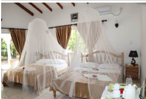
Two Double Bed Villa