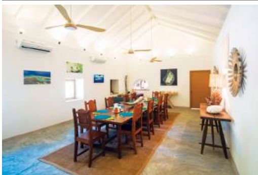
Lodge Dining Area