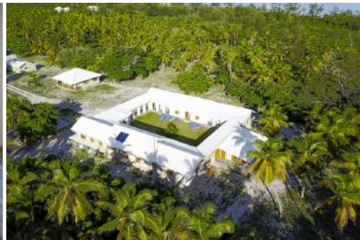
Coral House Aerial