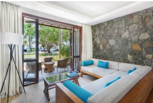
Ocean View Garden Room

Featuring three indoor venues including a ballroom and banquet hall that can accommodate up to 250 individuals for cocktail functions and up to 180 for a seated banquet, Kempinski can cater for a number of large corporate events, weddings and other special functions.