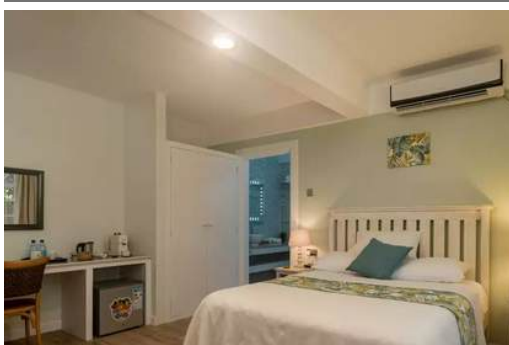
Double Room Garden View