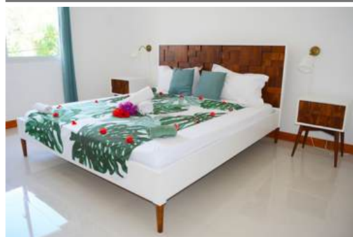
Bedroom with Queen Bed