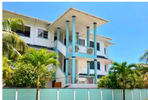
Front View Exterior

La Villa Therese Seychelles, a newly opened accommodation in Anse Royale, offers contemporary self-catering units with free private parking, 24/7 front desk, and complimentary WiFi. The well-equipped apartments feature balconies, mountain views, and modern amenities, including a fully-equipped kitchenette. Conveniently located within walking distance to multicultural restaurants, bars, and watersports facilities, it serves as an ideal base for exploring Mahe's beautiful coastal areas. Suitable for friend groups, families, and large gatherings, the property accommodates up to 36 guests.