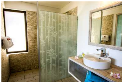
Ocean View Suite Bathroom