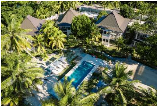
Exterior Guest Room Wing

Two swimming pools for the exclusive use of hotel guests.