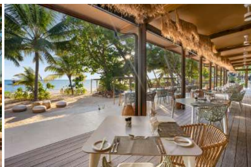
KokoSol Restaurant & Bar