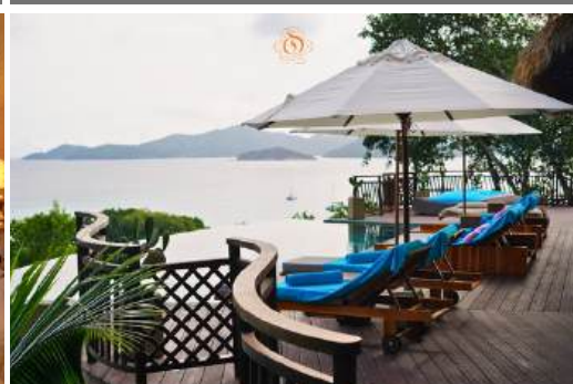
Presidential Villa Pool Area