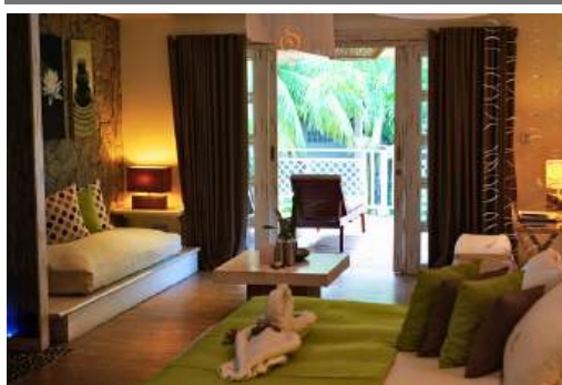
Garden Villa Room