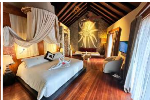
Villa de Charme