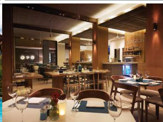
Marlin Bleu Restaurant & Bourgeois Bar