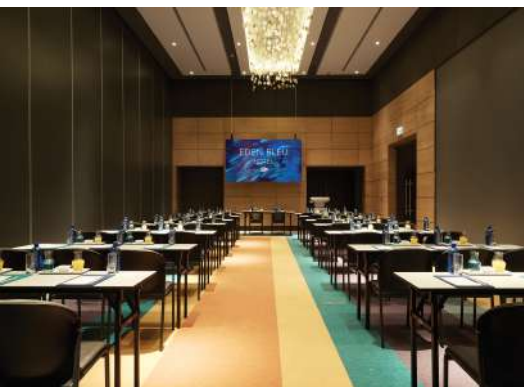
Sub-Divided Hotel Ballroom

Eden Island – Just a stroll away, the scenic Eden Island offers guests access to a vast array of shops and restaurants which are open throughout the day and evening. Various services can be accessed by visitors such as a Casino, Art Gallery, shopping outlets, and the Marina is a sight not to be missed with eye-catching yachts, some of which offer excursions and trips to visitors.