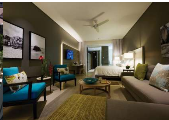
Luxury Marina View Suite