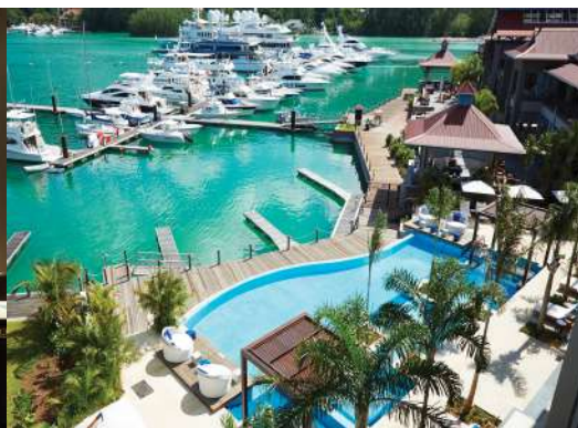
View Overlooking Eden Island Marina