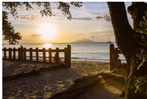
Direct Beach Access

Located along the glistening Beau Vallon Beach, offering direct beach access. Shops, restaurants, services and watersports activities such as snorkeling, diving, parasailing and more are all located nearby.