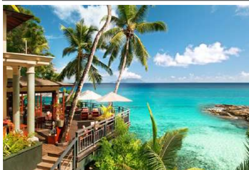
Ocean View Bar