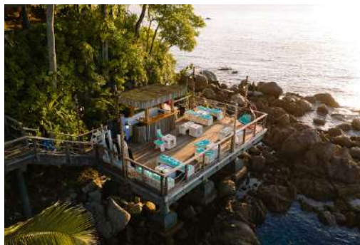
The Lower Deck