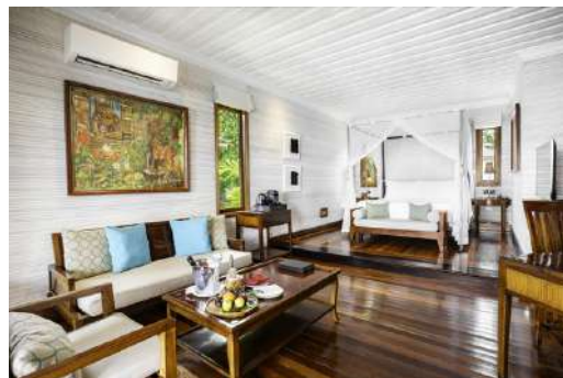
King Ocean View Villa

Spa & Wellness – The Eforea Spa is wrapped around the granite boulders at the base of the property, with treatment rooms overlooking the waves crashing into the rocks below. A range of treatments are on offer including a couples massage – ideal for honeymooners and newlyweds. A fitness center is also on site