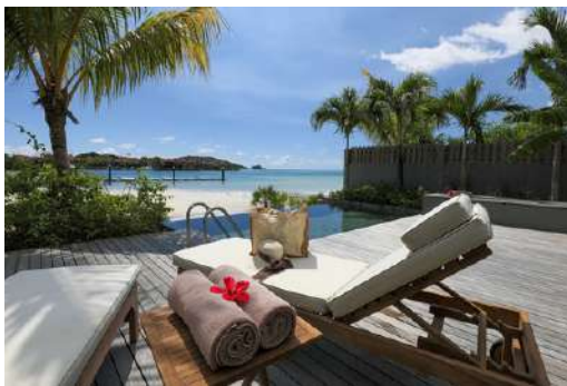
Pool & Beach View

Discover all the beautiful island of Mahé has to offer at JA Enchanted Waterfront. Ideally situated on the East Coast & close to Eden Plaza, JA Enchanted Waterfront is only 5 km away from Seychelles International Airport. With 2 luxurious Waterfront Villas equipped with 3 ensuite bedrooms and a fully serviced kitchen, 3 Lodge Rooms, and a poolside bistro, you will feel right at home at JA Enchanted Waterfront.