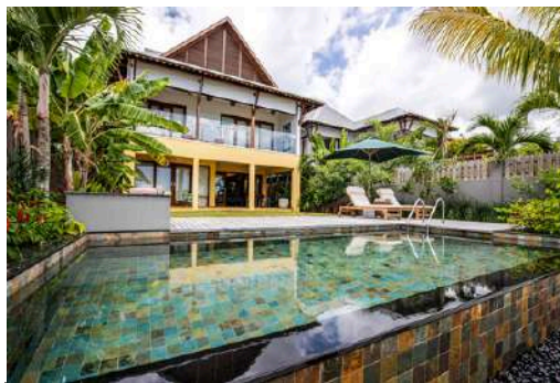
Private Pool Villa