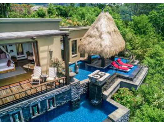
Premier Ocean View Pool Villa

IN VILLA/ON LOCATION DINING: For premier villa bookings, the luxury extends to dining anywhere guests desire, whether a windswept stretch of beach or the privacy of their sundeck.