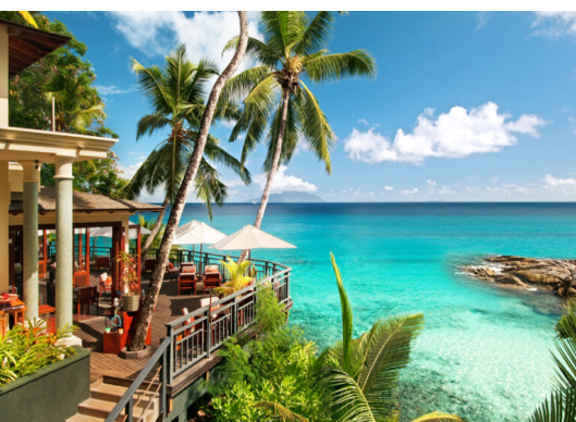
Ocean View Bar

Spa & Wellness – The Eforea Spa is wrapped around the granite boulders at the base of the property, with treatment rooms and a steam room overlooking the waves crashing into the rocks below. A range of treatments are on offer including a couple massage – ideal for honeymooners and newlyweds. A fitness centre is also on site.