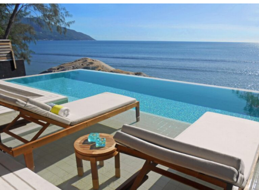
Oceanfront Pool Villa