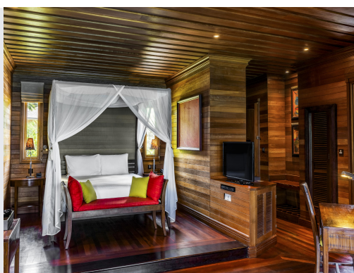
King Oceanview Villa