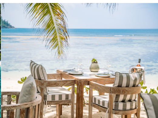
Windsong Beach Restaurant