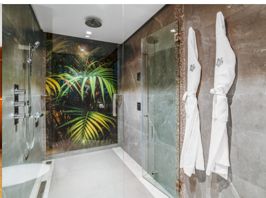
Deluxe Ocean View Garden Bathroom