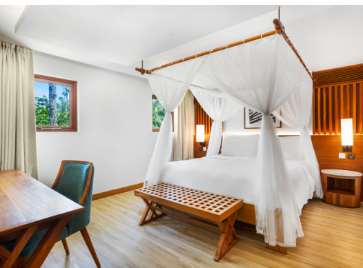
Deluxe Ocean View Suite