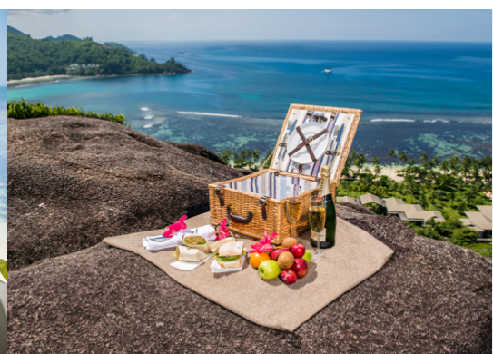
Picnic on the Hill