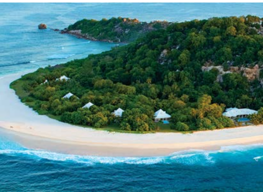
Aerial View of Villas