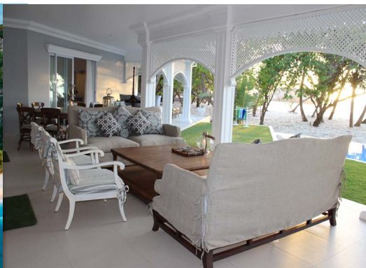
Presidential Villa Patio