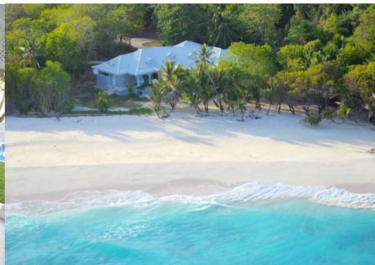
Arial View of Presidential Villa