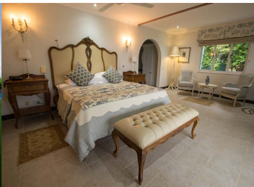
Luxury Villa Bedroom