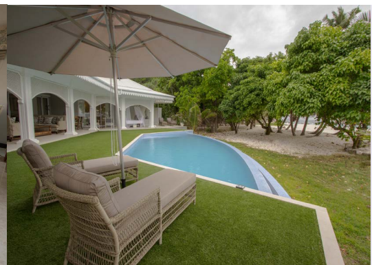
Presidential Villa Pool