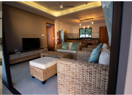
Two-Bedroom Living Room