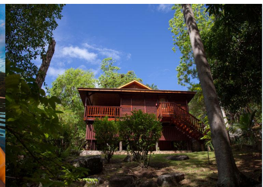
Tortoise Suite Exterior