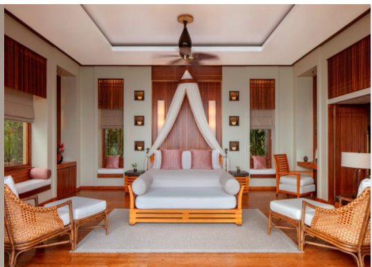
Ocean View Pool Bedroom