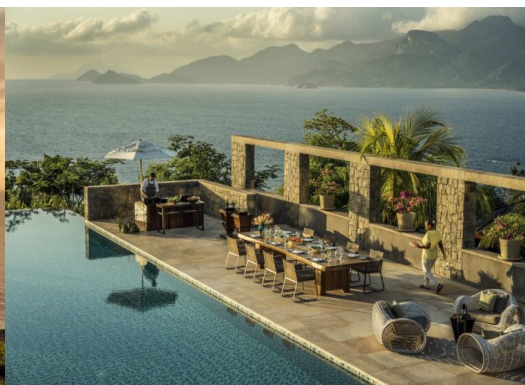
Residence Pool Villa