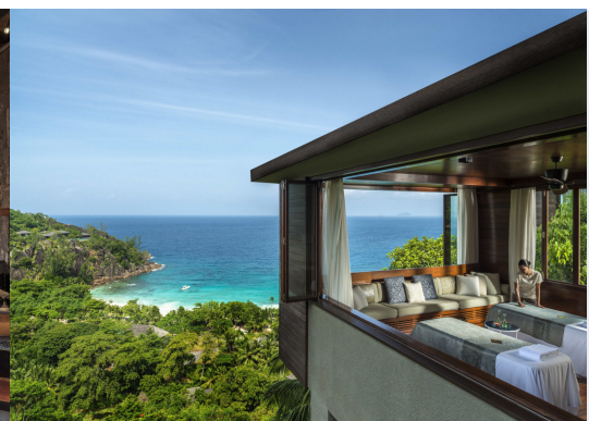
Spa Treatment Room