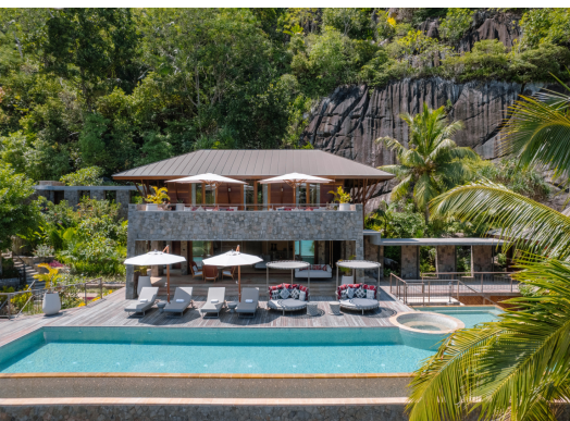
Three Bedroom Royal Suite