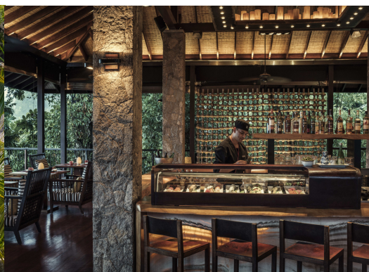
ZeZ Lounge Sushi Bar