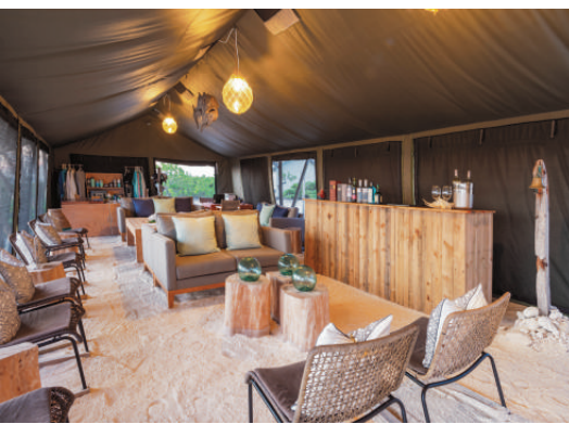
Restaurant & Bar