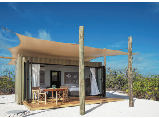
Eco Pods Exterior

Guests can enjoy a selection of activities such as bird watching, scuba diving, fly-fishing, and some watersports.