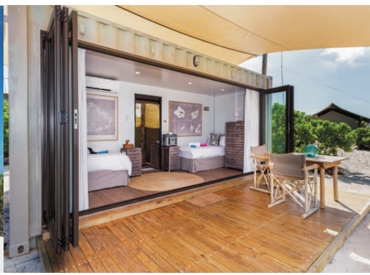
Eco Pod Bedroom