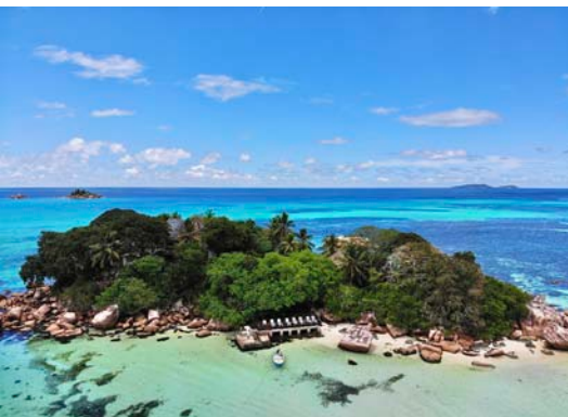
Chauve Souris Island

Located on a tranquille and secluded Chauve Souris Island, offering stunning ocean and garden views. The island is within a short boat trip to neighboring Praslin Island, where various services, shops, restaurants and activities are available.