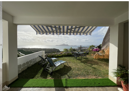
View from Patio