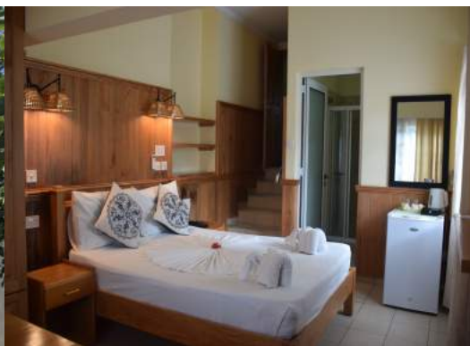
Standard Double Bed Room