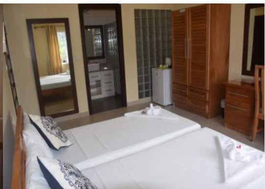
Standard 2 Single Bed Room