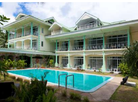
Exterior of the Hotel