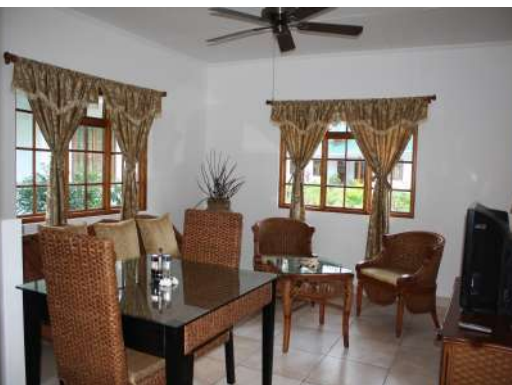
Dining & Living Area