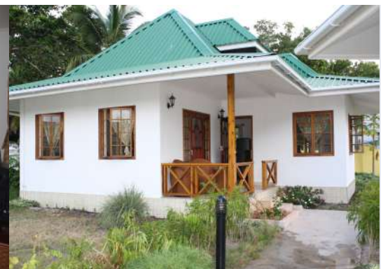
Exterior View of the Chalet