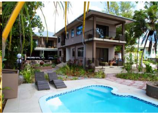
Swimming Pool Area