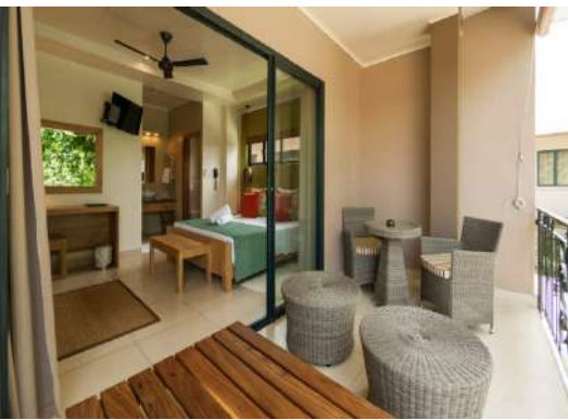
Superior Sea View Room

Loctated along the beautiful Anse Reunion Beach and within walking distance to nearby shops, restaurants, bicycle rentals and the La passe Jetty.