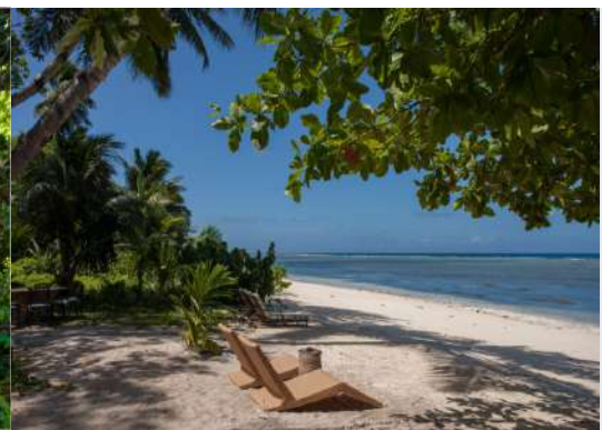
Anse Reunion Beach