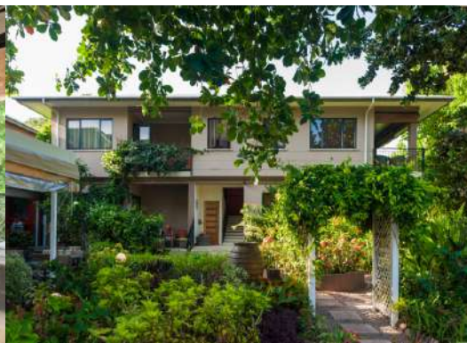
Exterior View of the Hotel