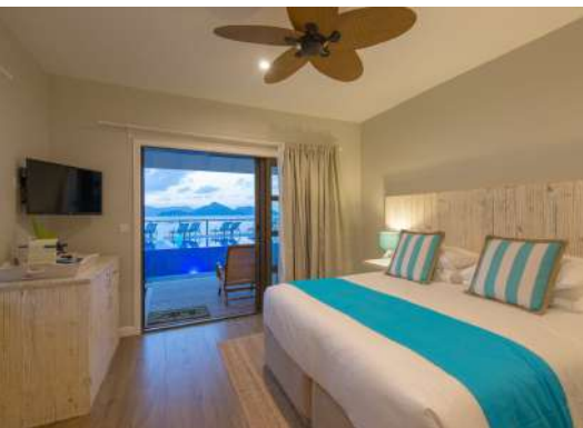
King Seafront Bedroom

Shops, restaurants and bicycle rentals located nearby. Spectacular views overlooking the ocean and neighboring islands.