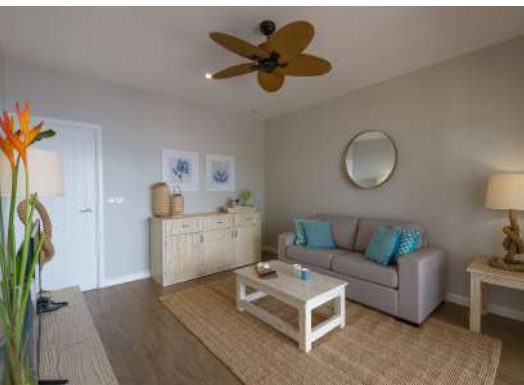
King Deluxe Lounge Area