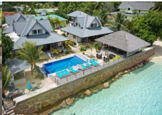
Aerial View of the Hotel