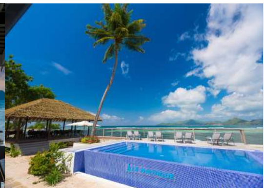
Swimming Pool Area