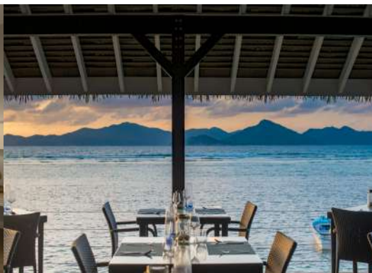
View Overlooking Neighboring Islands