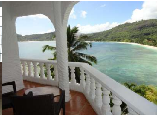
View Overlooking the Beach