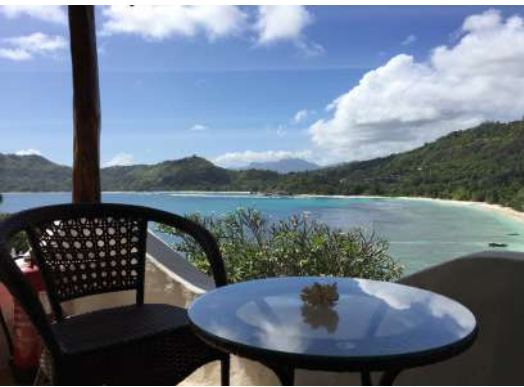
View of the Beach

All rooms host magnificent views over the beach and sea. Staff are available at any time at hotel reception whereby they are able to assist for any information such as recommended activities and places nearby.