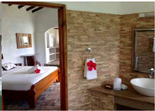
Bedroom and Bathroom