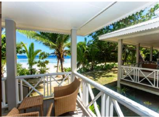
View from Private Balcony