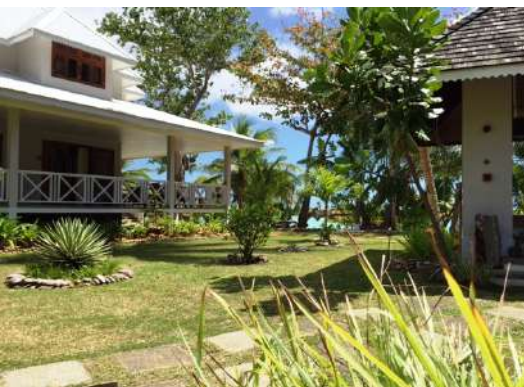
Exterior View of Lodge