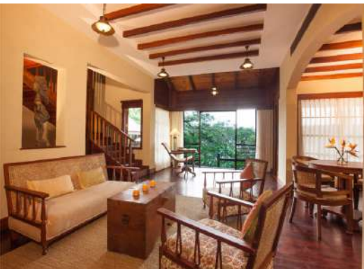
Enchanted Signature Villa

Spa & Wellness - There is a private mini spa open to one individual/couple at a time.