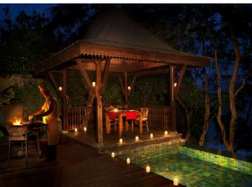
BBQ Diner Set-Up