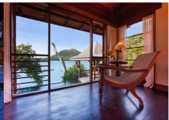
Private Pool Villa Living Room