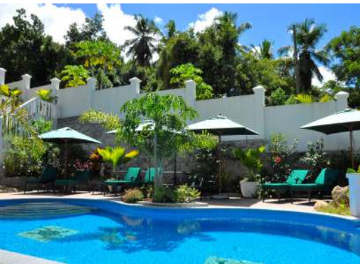
Swimming Pool Area

Beau Vallon Beach - Only a short stroll to the crystalline shores of the Beau Vallon Beach which is surrounded by various restaurants and bars for great meals, cocktails and a true sense of the island adventures possible in the Seychelles. Many activities are available for visitors such as parasailing, diving and snorkeling the beautiful reefs.