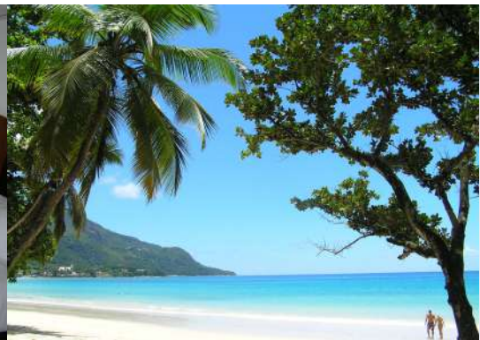
Beau Vallon Beach