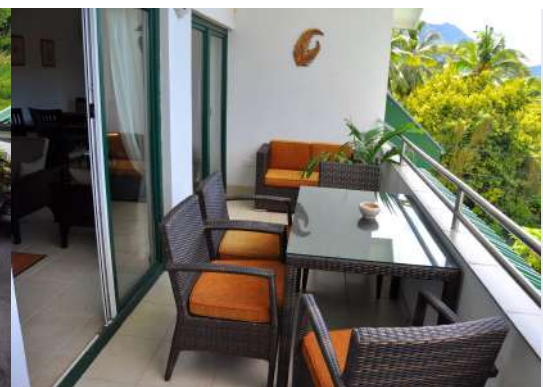
Penthouse Private Balcony