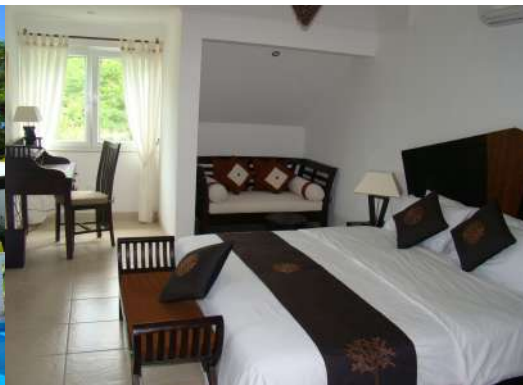
Penthouse Apartment Bedroom