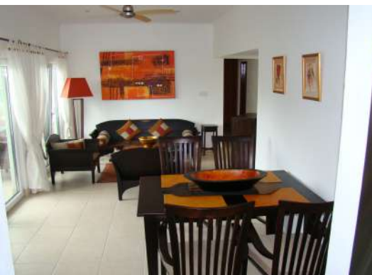
Penthouse Dining & Living Area