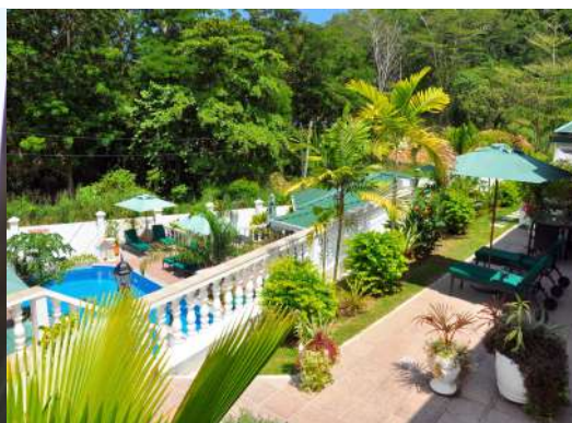
Pool Area & Terrace