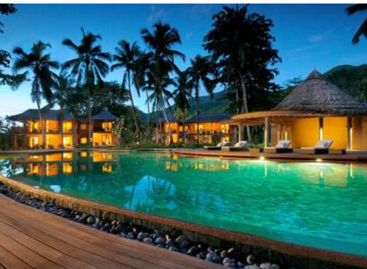
View of Hotel

Conferences, Meetings & Events – A large conference room offers space for 12 tables seating 9 people each. Two interconnecting meeting rooms provide space for smaller boardroom meetings, or as breakaway rooms for larger conference groups. Conference facilities include microphone/speakers, lectern and projection system.