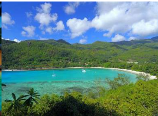
View of Port Launay Beach