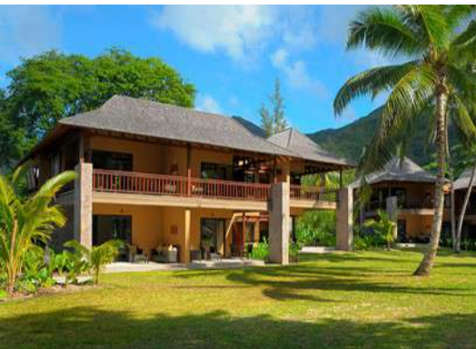
Exterior of Suites