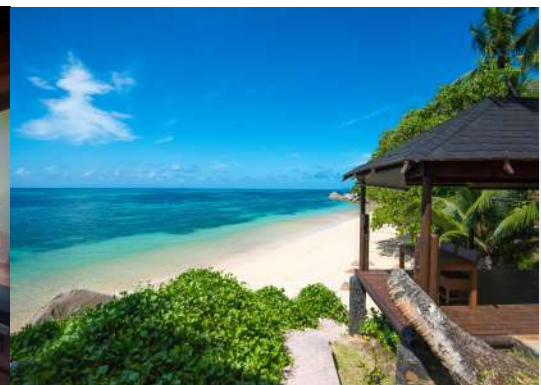
View of the Beach