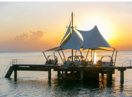
Over Ocean Pavilion

Stunning over ocean pavilion offers breathtaking views. In-house spa for guests to unwind, and a natural sea water swimming pool located at the hotel.