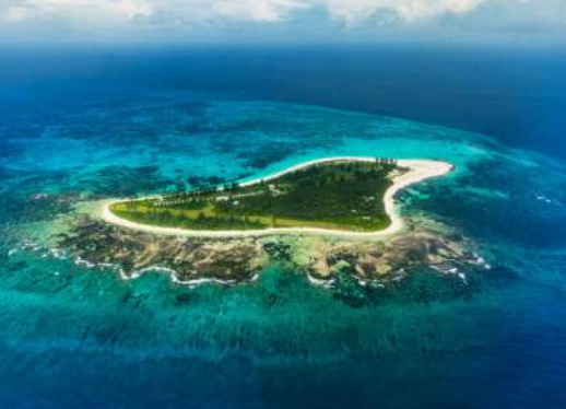
Aerial View of Bird Island