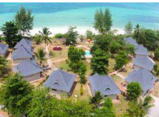
Beachfront Property with Pool